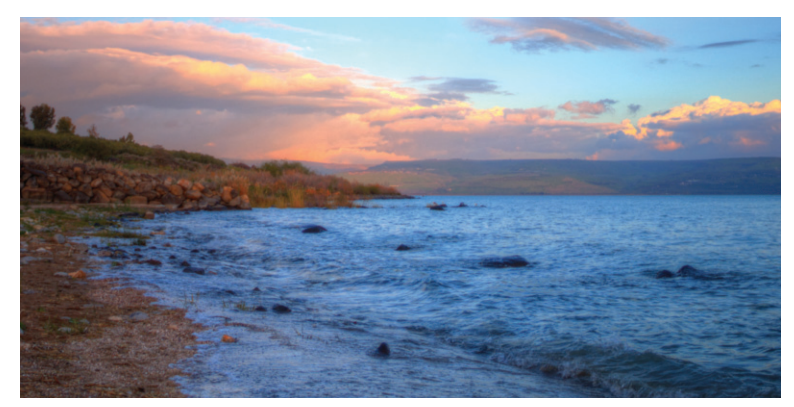
Tour: HL19 Date: 012019 Code: X ID: 50548

Final payment/online registration: October 19, 2018